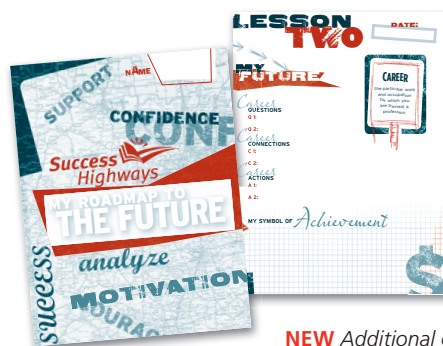
NEW Additional curriculum to extend student learning