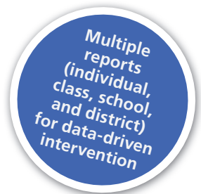
Academic Risk Index™ Reports identify which students are most at-risk.