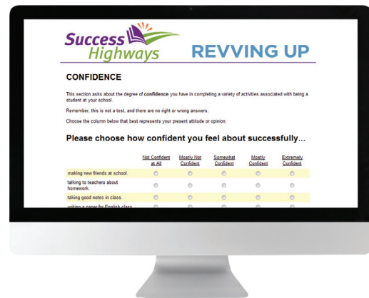
Early-warning assessments are available in online or print formats.