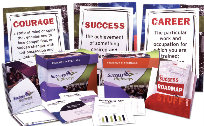
A complete set of curriculum builds academic resiliency skills.