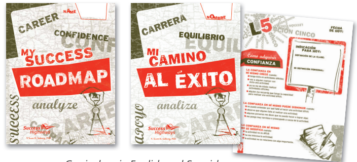
Curriculum in English and Spanish